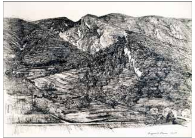
Study for Ménerbes 1974 Ink on paper 21"x28"