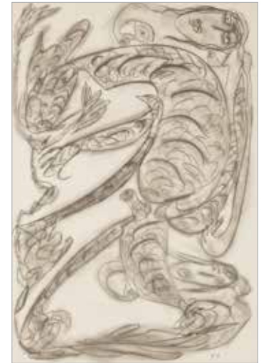
Holding on to the Tiger (2) ND Charcoal and pastel on paper 44" x 30"