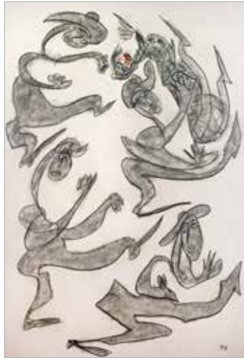
Dancing in the Streets 1997 Charcoal and pastel on paper 44" x 30"