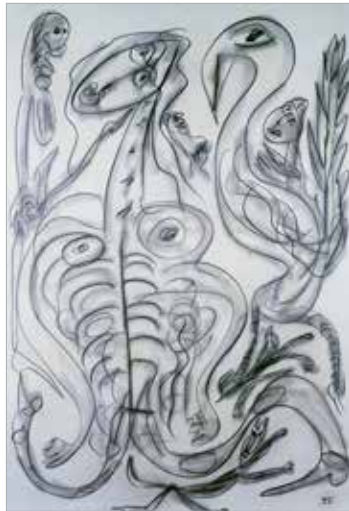
Doctors and X-Rays 1994 Graphite on paper 44" x 30"