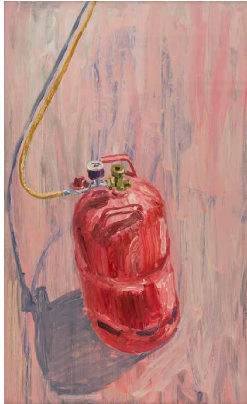
Bottle for Gas 2002 Oil on linen 53"x37"