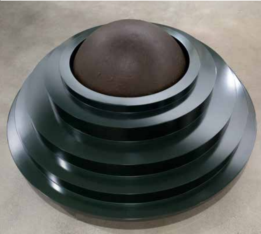
Hum 2002 Cast iron, fabricated and painted aluminum 29"×61"×61"