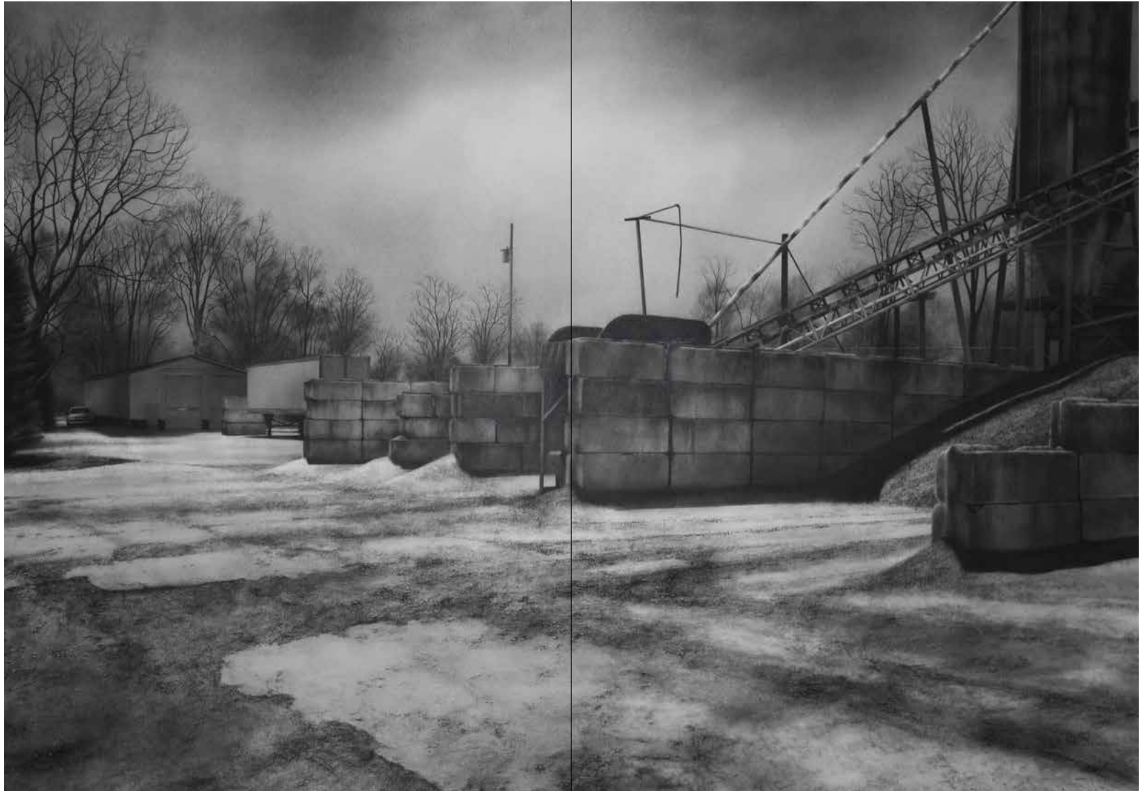
Rahn's in Winter 2016 Conte crayon 45" x 68"