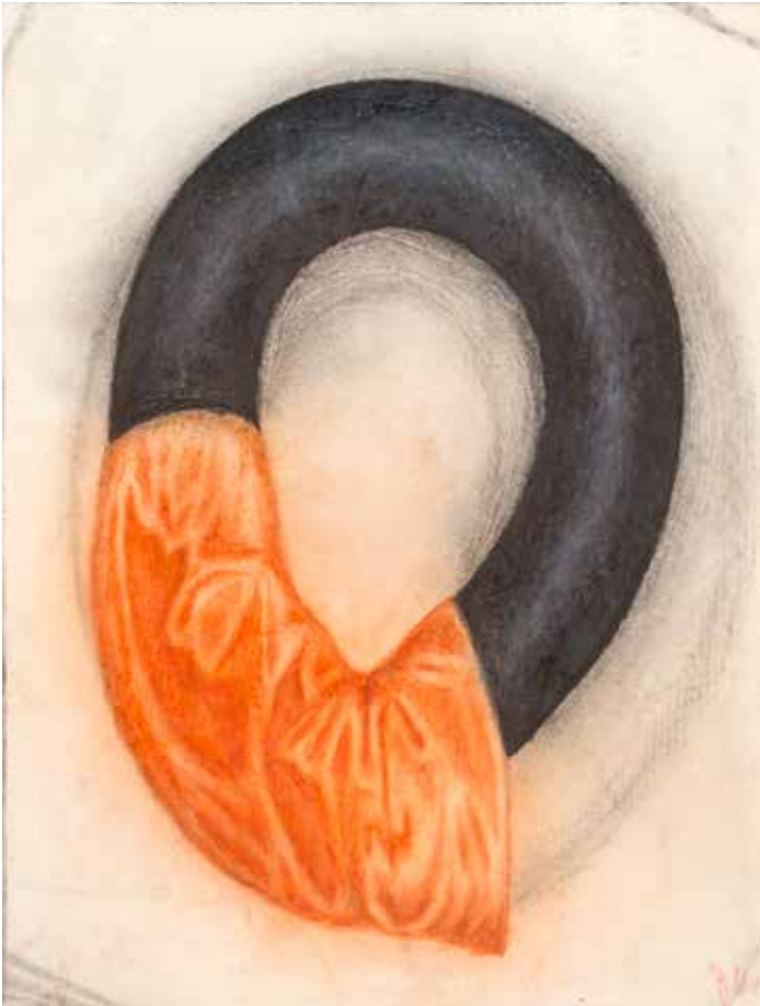
Untitled 2011 Graphite and colored pencil on paper 12"x9"