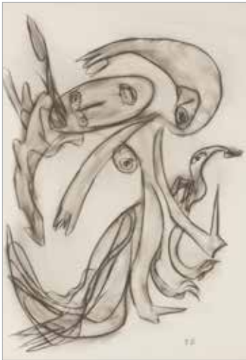
Passing by the Bird (2) ND Charcoal and pastel on paper 44" x 30"