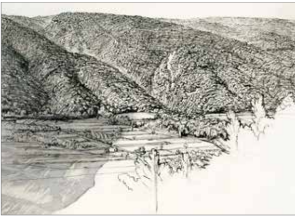
Study for Vines 1978 Watercolor and pencil on paper 19"x24"