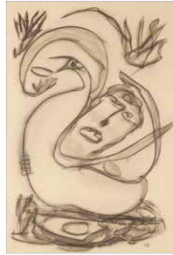
Looking for a Home 1998 Charcoal and pastel on paper 44" x 30"