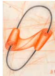
Untitled 2011 Graphite and colored pencil on paper 9"x13"