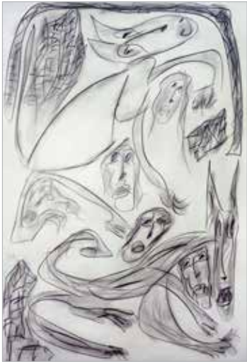
Ladies and Mules (Everybody Strives for a Home) 1994 Graphite on paper 44" x 30"