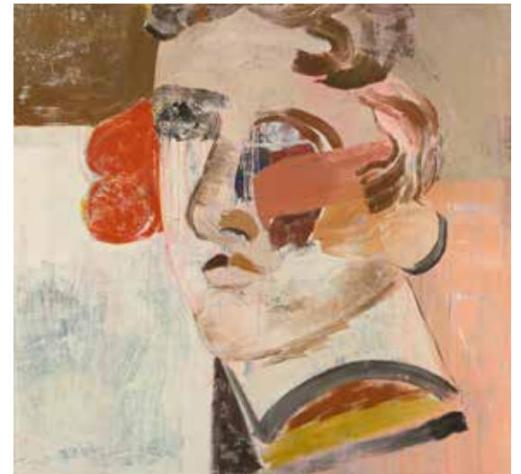
1+1=3 2010 Oil on canvas 54" x 56"