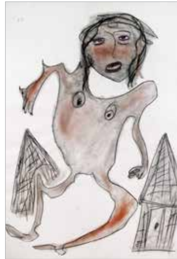
Holding on to the Nest (2) ND Charcoal and pastel on paper 44" x 30"