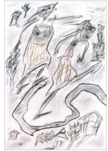
Looking for the Main Road 1996 Charcoal on paper 44" x 30"